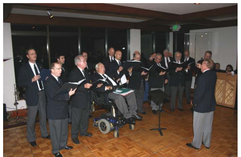
The St Francis Sons of the Seas Singers